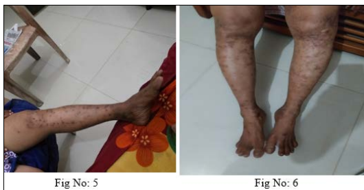
Third visit: 25/6/22