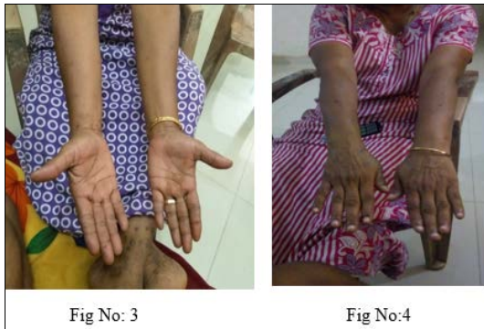
Second visit: 21/5/22