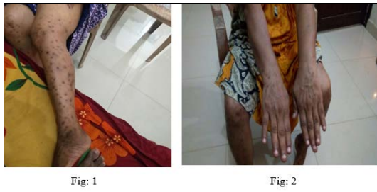
First visit: 7/5/22