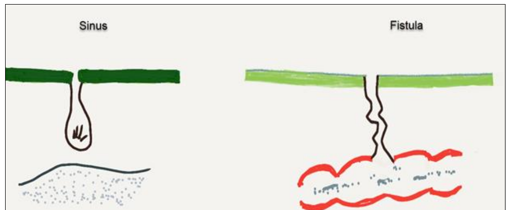
Fig 1: Umbilical Sinus

A sinus is a blind- ending tract connecting a cavity lined by granulation tissue to an epithelial surface. Often this cavity is filled with pus. Sinuses are divided into 2 parts. One is congenital and other is acquired. Congenital sinuses are the remnant of persistent embryonic ducts while acquired sinuses can result from A retained any foreign body (in grown hair or suture material), some chronic infection like Tuberculosis, osteomyelitis etc, chronic inflammation, Malignancy or inadequate surgical drainage of the cavity. In Allopathic way this entity comes under surgical case because sinuses are not responding much to conservative treatment. Sinus can be reopened and repair it surgically. There are excellent medicines in homoeopathy to treat such a cases without any surgery. Some homoeopathic medicine are having tendency to expel the foreign material present inside cavity.