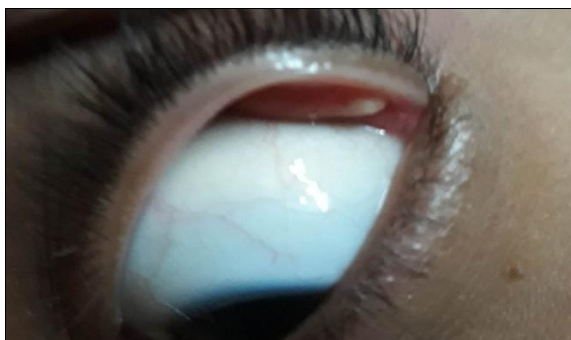
Fig 2: (4 th June 2022)