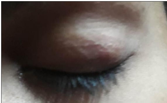
Fig 1: (4 th June 2022)