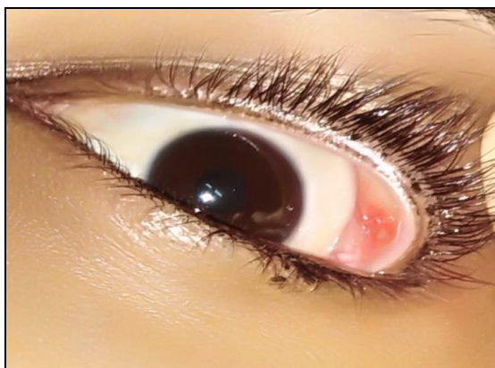
Fig 3: (7 th June 2022)