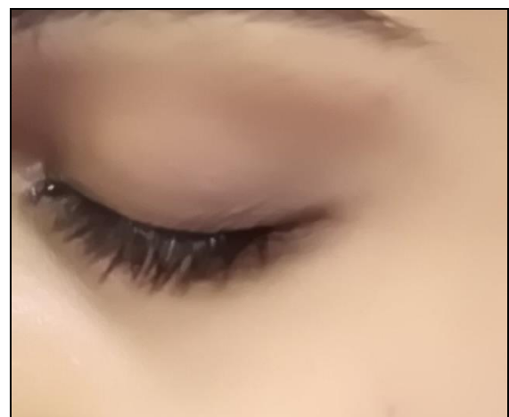
Fig 6: (12 th June 2022)