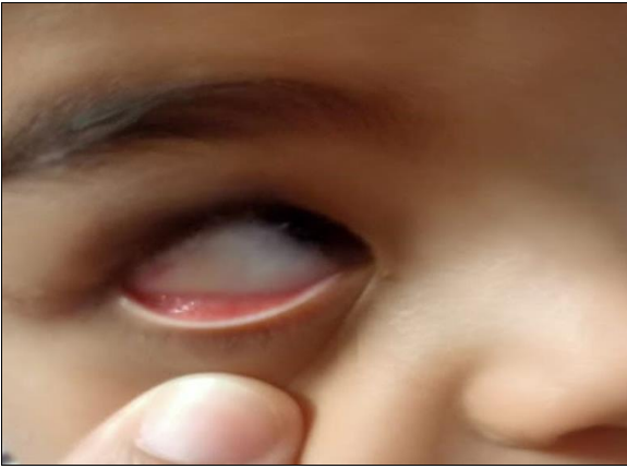
Fig 6: 4th day after treatment