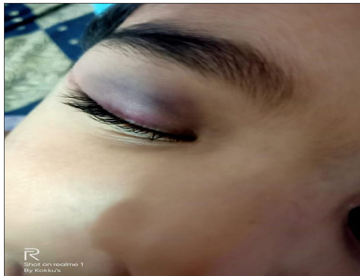
Fig 1: Injury before treatment

A five year old boy had reported to the clinic on 23 rd April 2021 with the complaints of injury over the right upper eyelid. The child developed bluish discoloration followed by swelling and was crying due to pain and discomfortness in the closure of eye. Pain aggravated by closing the eye, ameliorated by moving the eyelid.