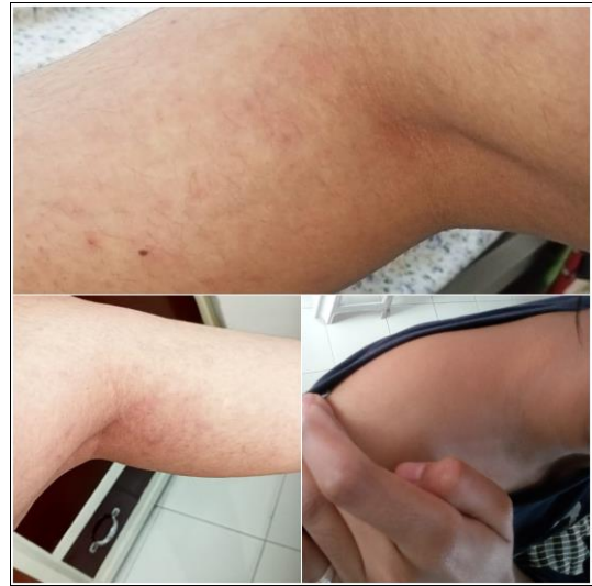
Fig 2: During Treatment- 09/10/2023 at 01:00 PM

9/12/2023 R x Rhus Toxicodendron 30 in every 2 hours 3 doses