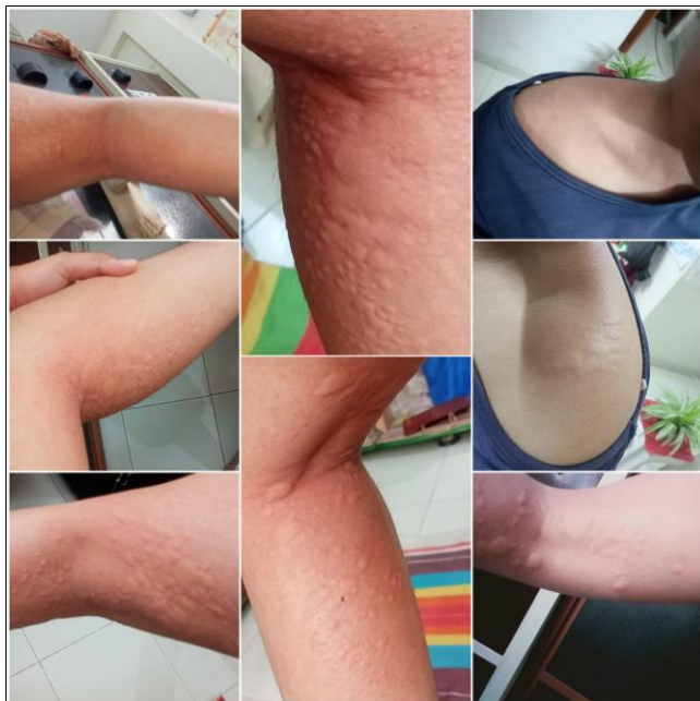
Fig 1: Before Treatment- 09/10/2023 at 10:00 AM