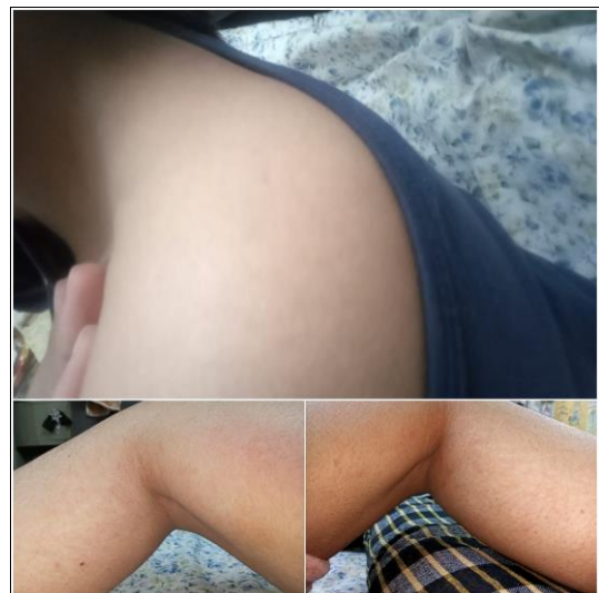
Fig 4: During Treatment- 10/10/2023 at 10:00 PM