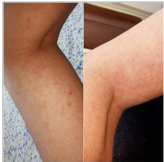
Fig 3: During Treatment- 09/10/2023 at 03:45 PM