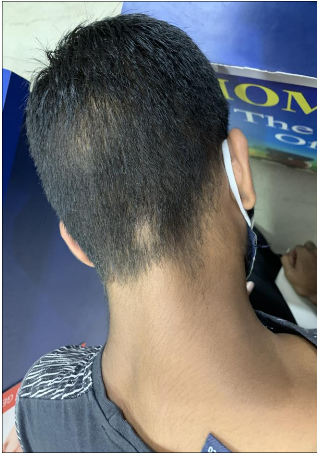
Fig 12: During treatment 15 July 2021