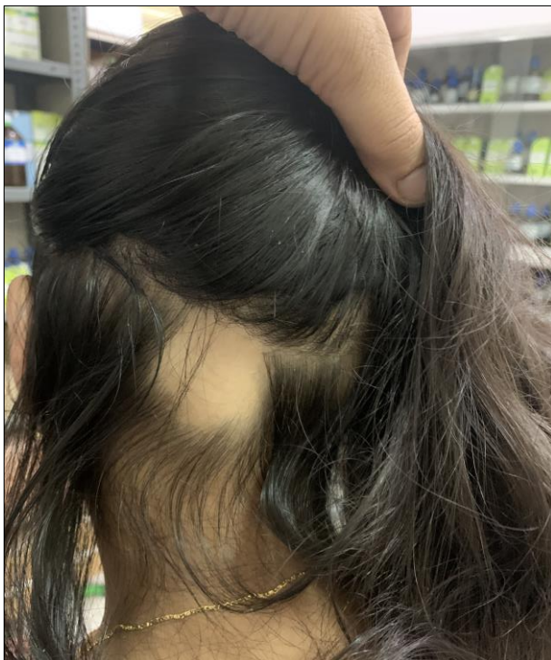
Fig 5: Before Treatment