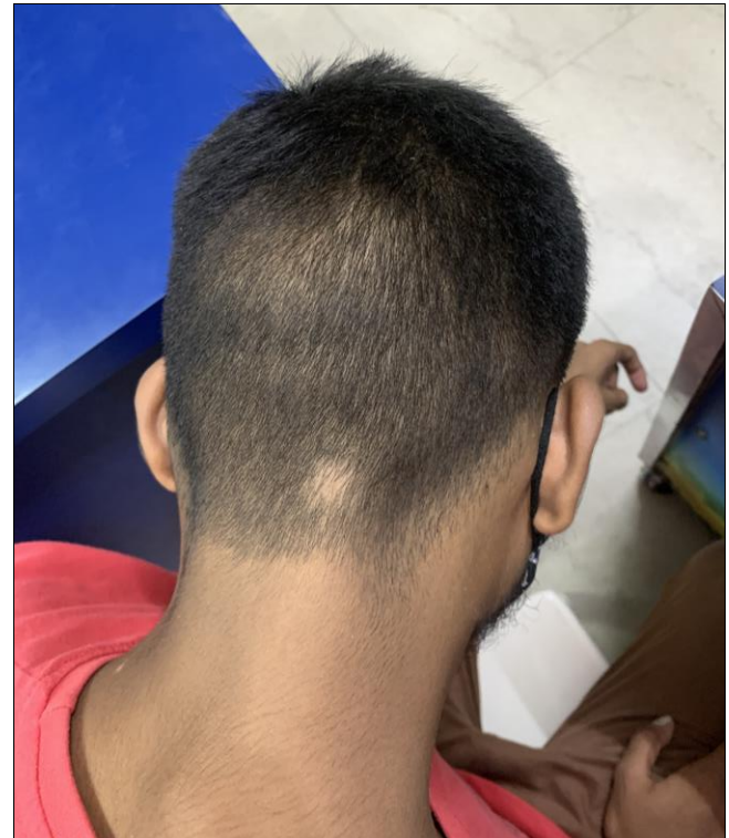
Fig 11:- During treatment 24 June 2021