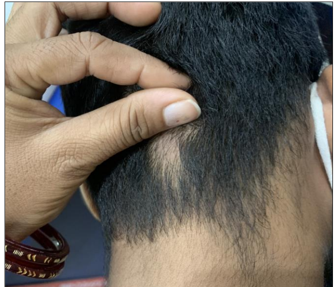
Fig 10: During treatment 9 June 2021