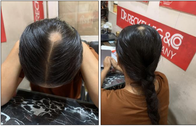
Fig 2: Before treatment