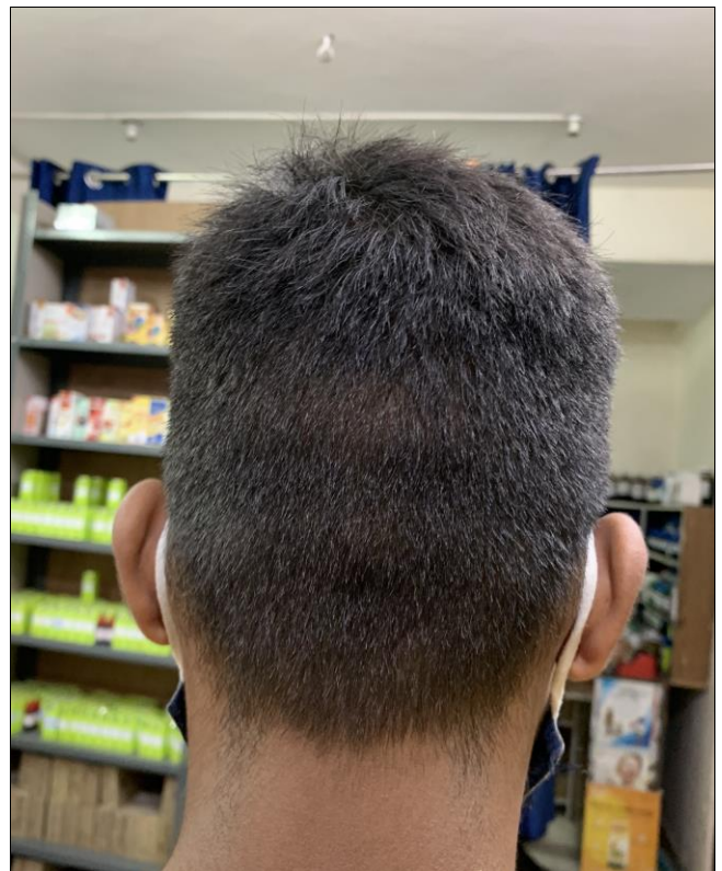
Fig 15: After treatment 09 September 2021