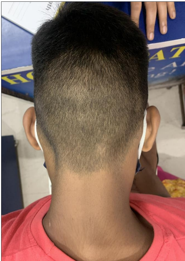
Fig 13: During treatment 5 August 2021