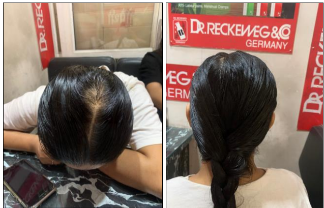
Fig 3: After treatment