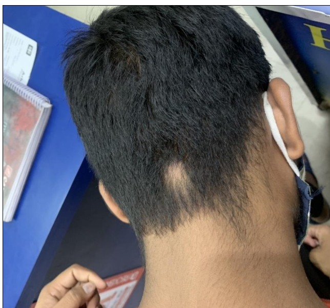
Fig 9: During treatment 27 May 2021 (patch size increased)