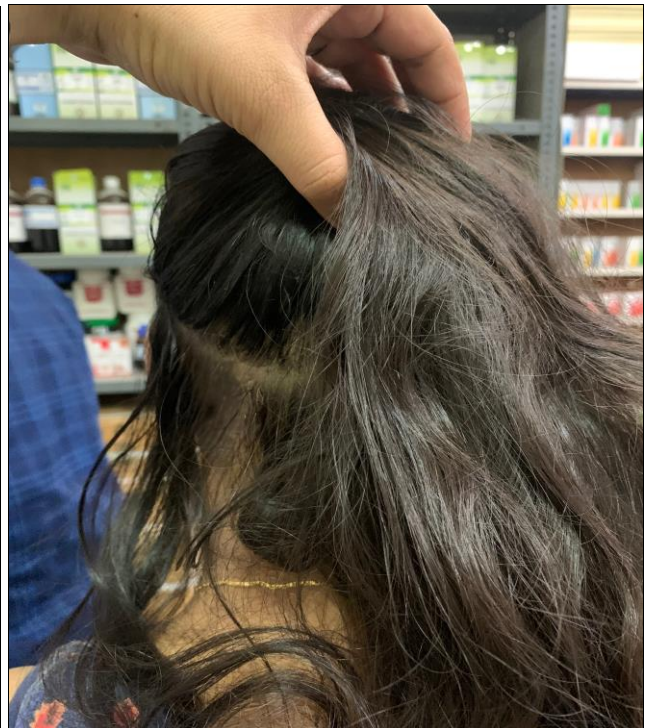
Fig 6: After Treatment