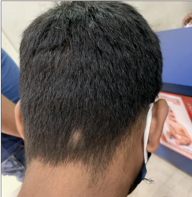
Fig 8: Before treatment 29 April 2021